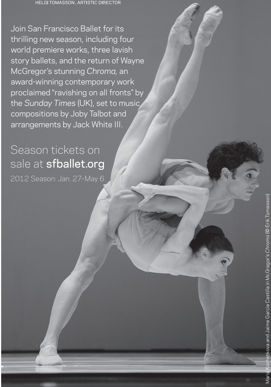
Maria Kochetkova and Jaime Garcia Castilla in McGregor's Chroma

SAN FRANCISCO BALLET NUTCRACKER HELGI TOMASSON * ARTISTIC DIRECTOR